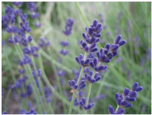
Photo 3. Lavandula angustifolia Mill. - Flower before the petals emerge (Original)

As verticiles are disposed at the base, the inflorescence looks like a long spike (3-7 cm). The flowers have brown membraneous oval bracts; the calyx is cylindrical, hairy and glandular; and the bilabiated membraneous corolla has fine hairs.