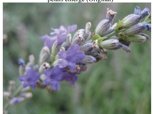
Photo 4. Lavandula angustifolia Mill. - Calyx and corolla (Original)

The species generally flowers from June to August. Lavender has a fresh, floral scent as a top note and base note of green grass with a slightly bitter taste.