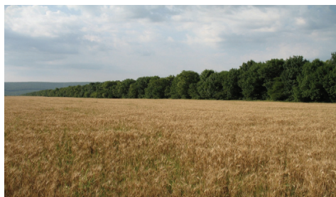
Fig.1. Field that location of soil profiles no. 35

Experience variations used for monitoring are: Control; N 60 P 60 K 60 ; N 120 P 60 K 60 ; N 300 P 60 K 60 . Experience was founded in 1964 on quasi horizontal surface of a high terrace of rivulets Mota, tributary of the river Raut. Surface rocks are Quaternary loess deposits. In the years 1996-2005, from lack of fertilizers, soil fertilization on the variants was not made. The research was limited to studying soil fertilization post action ongoing for 30 years. In 2006 the introduction of fertilizers on the variants was resumed [1].