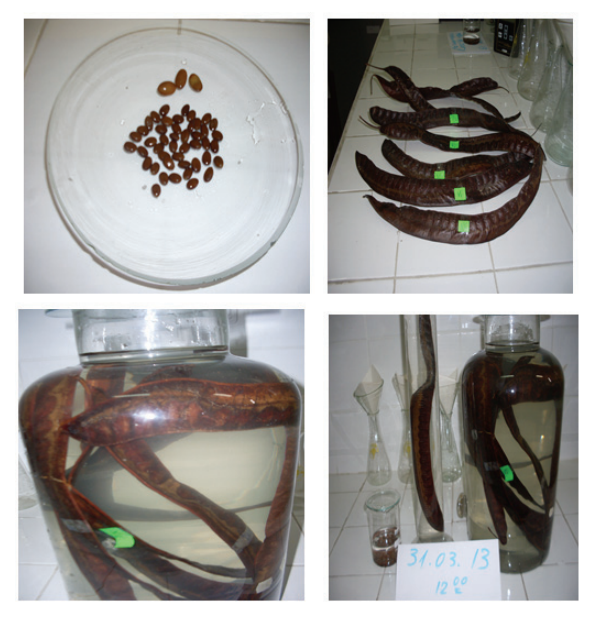
Figure 1. Sample preparation for work