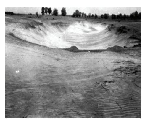
Figure 4. Aeolian excavation (Sud Smârdan)