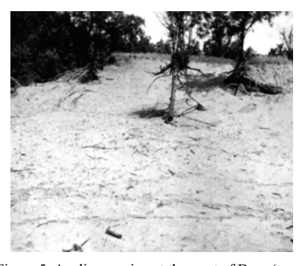
Figure 5. Aeolian erosion at the west of Desa (trees uprootal)