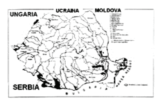
Figure 1. The map of sandy soils occurrence in Romania (scale 1:3,500,000)

These kinds of soils appear in our country only on sands of Aeolian origin and are represented only by some subdivisions of the eutricambosoil, preluviosoil and luvosoil types (SRTS, 2012).