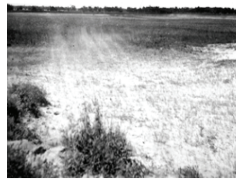
Figure 3. Deflation processes (S Ciuperceni)

The air movement under the form of wind has a special influence mainly on the geographical landscape. Through its action of erosion, transport and accretion it creates forms of Aeolian relief – dunes – that continuously advance in the direction of the wind, excavations, tree uprootals, but also a specific microrelief of "ripple marks" (Figures 3, 4, 5, and 6) that eventually could, very well, explain the layer-interlayer sequence characteristic of the tabular soils.