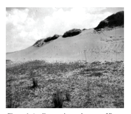
Figure 6. Aeolian erosion at the west of Desa