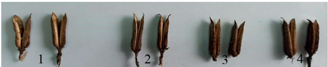
Figure 3. The effect of preparations based on adhesives and surface-active substances on the cracking of pods: 1 - Control, 2 - Raps kley, 3 - Agrolip, 4 - N'yu Fylm-17

ripening, which allows collecting uniform ripe seeds. Thus, according to our observations, the best effect was precisely from the use of the drug Agrolip (Figure 3).