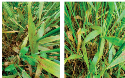
Figure 2. Barley crop aspect - in the conventional culture (original)