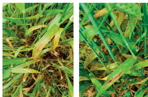
Figure 3. Barley crop aspect- in the conversion period (original)