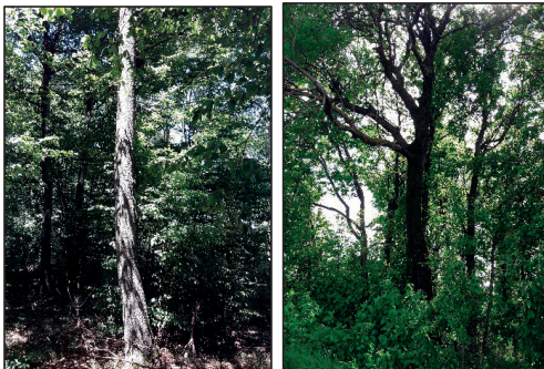
Figure 2. Fragments of forest ecosystems

Experimental sites with typical and luvisc brown soil are located in the central zone of the Republic of Moldova, in the wooded steppe of the central - Moldovan forest province, in the district No. 8 of brown, gray forest soils and leached chernozems of the wooded steppe of hilly Kodru Forests.