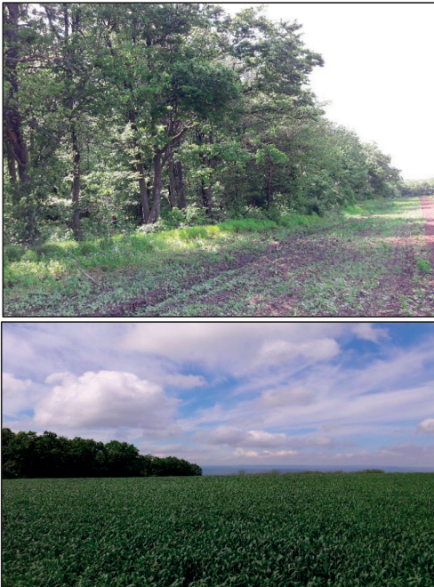
Figure 1. Fragments of natural and agricultural landscapes located in the central and northern zone of the Republic of Moldova

Experimental sites are located in central and northern zones of the Republic of Moldova (Figure 1). The content of Carabidae family in soils with the normal profile in the condition of the long-term use in agricultural production were investigated in comparison with the undisturbed soils in natural ecosystems (Figure 2). Six experimental sites have been tested.