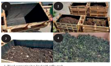
Wood composting box lined with raffia mesh. The four wood boxes loaded with the compost substrate. Thermometers used for temeperature control. Dehvdrated nettle plants.

thermometer and some bulking agent (dehydrated nettle plants) were added in box 2, one month after composting had started (the objective of this addition is not presented in this work).