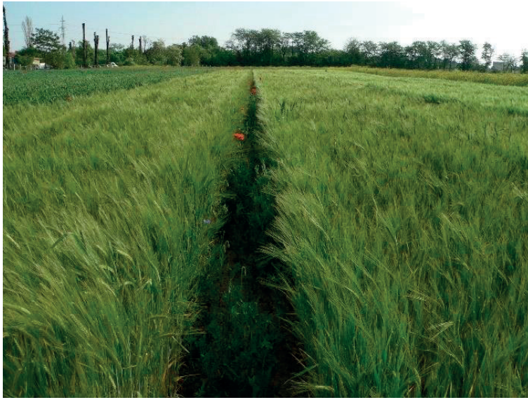
Figure 4. Treated Nives variety plots