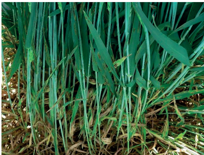
Figure 2. Untreated control (Nives variety)

Net blotch of barley symptoms have occurred on the leaves of the plants. Small circular to elliptical brown spots appeared on leaves and enlarge into, narrow, dark brown and transverse striations, forming the characteristic netlike pattern. The affected part of the leaf turned brown and the adjoining tissue became chlorotic and areas of dead tissue were formed. Severely infected leaves became completely necrotic and dry up. The fungus produces pseudothecia on infected tissues when the plant has matured. The most significant damage occurred in April on second leaves.