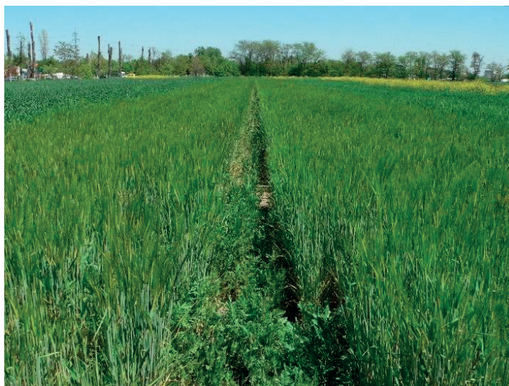
Figure 1. Dimitra variety on 22 April 2018

The highest infection levels were observed on the variety Nives (Figure 2).