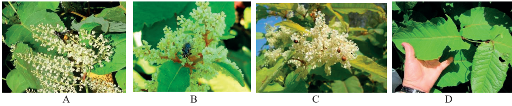
Figure 2. Insect species found on inflorescences and leaves of R. sachalinensis : A - Scolia hirta ; B - Sarcophaga carnaria ; C - Cantharis pellucida ; D - leaves affected by insects

The graphical representation of Figure 3 highlights the maximum share of the population of insects detected on the researched crop, with the predominance of the species of insects of the order Coleoptera, which constitutes 29% of all the diversity of the species of insects collected from the field and analyzed. The species of the orders Diptera and Hymenoptera constitute 19%, followed by species of the orders Hemiptera and Homoptera with 10% each. The number of butterflies and moths of the order Lepidoptera was lower - 6%, in terms of diversity and numerical density, but individuals of the orders Neuroptera and Mecoptera belonged to a single species (Figure 3).