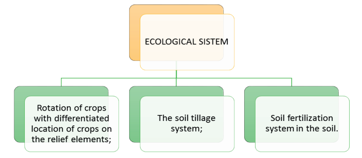
Figure 2. Basic pillars in the organic farming system

This can only be done if the order is established in the three basic pillars on which any agricultural system is based (Figure 2):