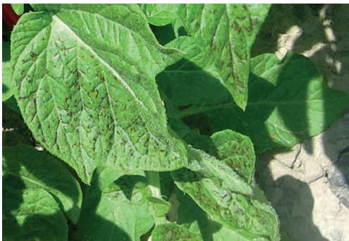
Figure 3. Potato virus Y/PVY ( https://www.agroscope.admin.ch/agroscope/fr/home/actualite/kurznews/2017/livre-PVY.html )

The symptoms are more often than not the formation of marble and mosaic patterns. Virus Y O strains usually encourage the curling of the leaves and even to the necrotic spotting of the leaves of some cultivars. Many cultivars infected with virus Y C have symptoms of necrotic spotting.