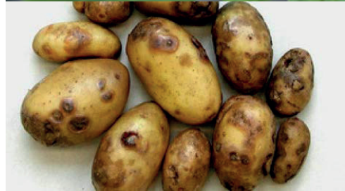
Figure 4. Potato virus Y NTN /PVY NTN ( https://www.akkerwijzer.nl/artikel/85725-yntn-virus-velop-in-consumptieaardappelen/ )