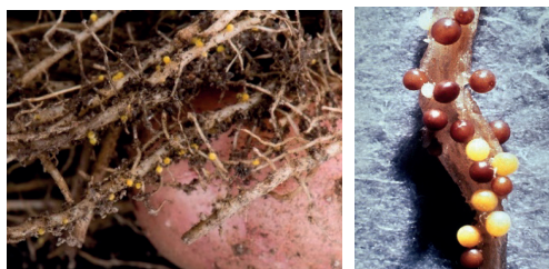
Figure 6. Globodera spp.

system is much more extended, because the infected roots branch out more. Swollen cysts can be seen on the roots, like needle point, 6-8 weeks after planting (Figure 6).