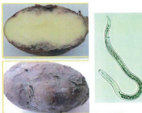
Figure 7. Ditylenchus destructor

( Ditylenchus destructor ) is a pest the attacks of which have serious consequences for potato crops (Figure 7). This pest generated serious damage to the potato crop, both on the quantity and on the quality of the crop. The nematode is a worm which attacks only the underground parts of the plant. No signs of the attack are visible on the surface. On the potato tubers, the nematode attack created small discolored areas, where the epidermis is discolored and starts to crack. The tubers attacked by the nematode become brown and have a texture characteristic for the rot attack. The attack of these worms affects the crop quality and the yield.