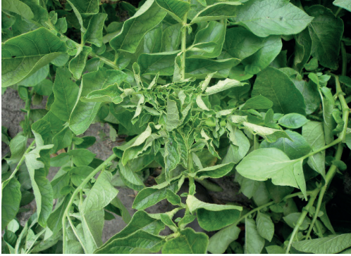
Figure 2. Potato leafroll virus - PLRV ( http://kb-dev.gramophone.in/tag/leaf-roll-virus/?lang=en )

In the field, this virus is persistently spread only by aphids. The Myzus persicae aphid is the most effective vector.