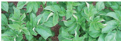
Figure 5. Potato virus M (PVM)

Potato virus M is transmitted by contact, but in the field, it is generally spread by aphids, non-persistently (Figure 5). Myzus persicae and Aphis nasturtii are the most important vectors.