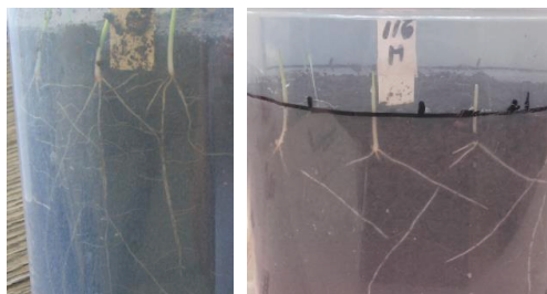
Figure 1. The seminal root angle of Izvor (left) and F00642 (right) genotypes

The value of angle of seminal roots for Izvor genotype (known as drought resistant by its osmotic adjustment capacity) was 82° as compared with genotype F00642 (115°), without adjustment capacity (Figure 1).