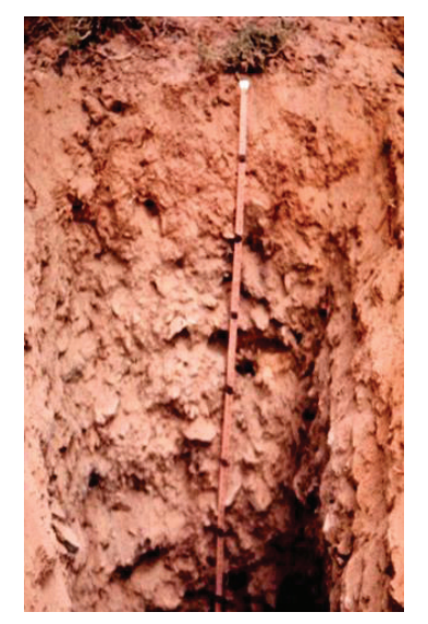
Figure 1. Reddisch light brown cryodesertic or Cryo Regosol

Strengthening the anthropogenic and technological impact on the soil cover of the Western Pamir leads to disruption of the established biosphere equilibrium and negative consequences.