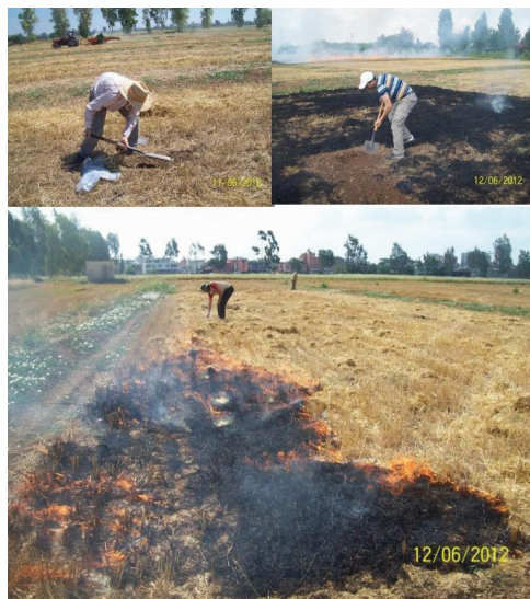
Figure 2. Taken soil samples in burning field areas