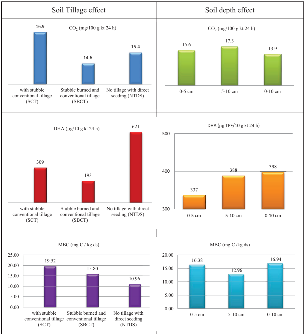
Figure 3. General effect of Different soil tillage applications and soil depth on CO 2 (mg/100 g kt 24 h), DHA (mg/10 g kt 24 h) and MBC (mg C/kg ds)