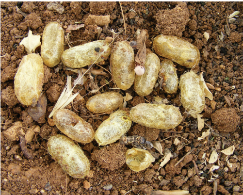
Figure 7. Cocoons in soil of Cimbex quadrimaculata

Cultural Control: Harmful cocoons found in the soil (Figure 7) in the tree crown projection can be destroyed by cultivation. Simply tilling or plowing a almond orchard before winter may disrupt a pest's life cycle by causing mechanical injury, by increasing exposure to lethal cold temperatures, by intensifying predation by birds or small mammals, or by burying the pests deep beneath the soil surface.