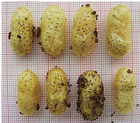
Figure 3. Cocoons of Cimbex quadrimaculata

Larvae: Larvae of Cimbex quadrimaculata are grayish and black markings. The average length of these larvae can reach about 20 millimeters (0.79 in), with a maximum of about 50 millimeters (1.9 in) in last larval instars. The larvae are big and full-bodied. The larval head capsule is black in the first larval instars. The last larval instar head capsule is white (Figure 4). It stops on the curved leaves during larval feeding. The larvae secrete a yellowish substance tapping by hand.