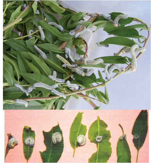
Figure 4. The first larval instars and the last larval instars of Cimbex quadrimaculata

Such a formation of almond trees do not fruit next year cannot afford to continue their normal activities; it greatly improves the susceptibility to falls and cold.