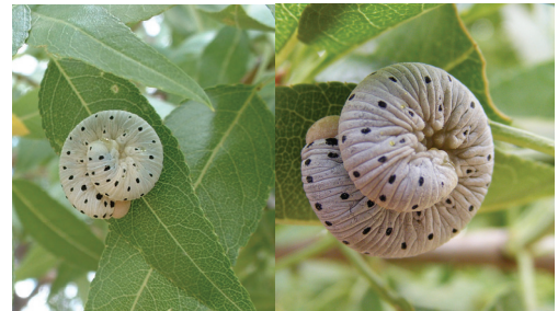
Figure 5. The last larval instars of Cimbex quadrimaculata

Biological Control: In Turkey, the presence of 3 parasitoid species of C. quadrimaculata , which is an important almond pest, has significant importance in enhancing the potential to control the abundance of C. quadrimaculata in almond orchards. Larvae and pupae of Cimbex quadrimaculata are parasitized by Opheltes glaucopterus , Listrognathus mactator and Phobetes nigriceps (Özgen et al., 2010; Özbeğ, 2014).