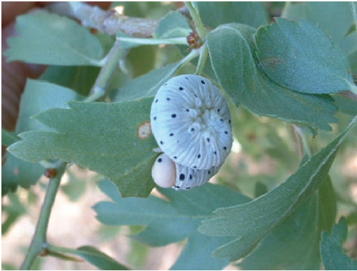
Figure 2. Last larval stage of Cimbex quadrimaculata on Crataegus monogyna