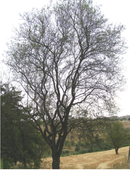
Figure 6. The damage on almond tree of larvae Cimbex quadrimaculata

Cultural Control: Harmful cocoons found in the soil (Figure 7) in the tree crown projection can be destroyed by cultivation. Simply tilling or plowing a almond orchard before winter may disrupt a pest's life cycle by causing mechanical injury, by increasing exposure to lethal cold temperatures, by intensifying predation by birds or small mammals, or by burying the pests deep beneath the soil surface.